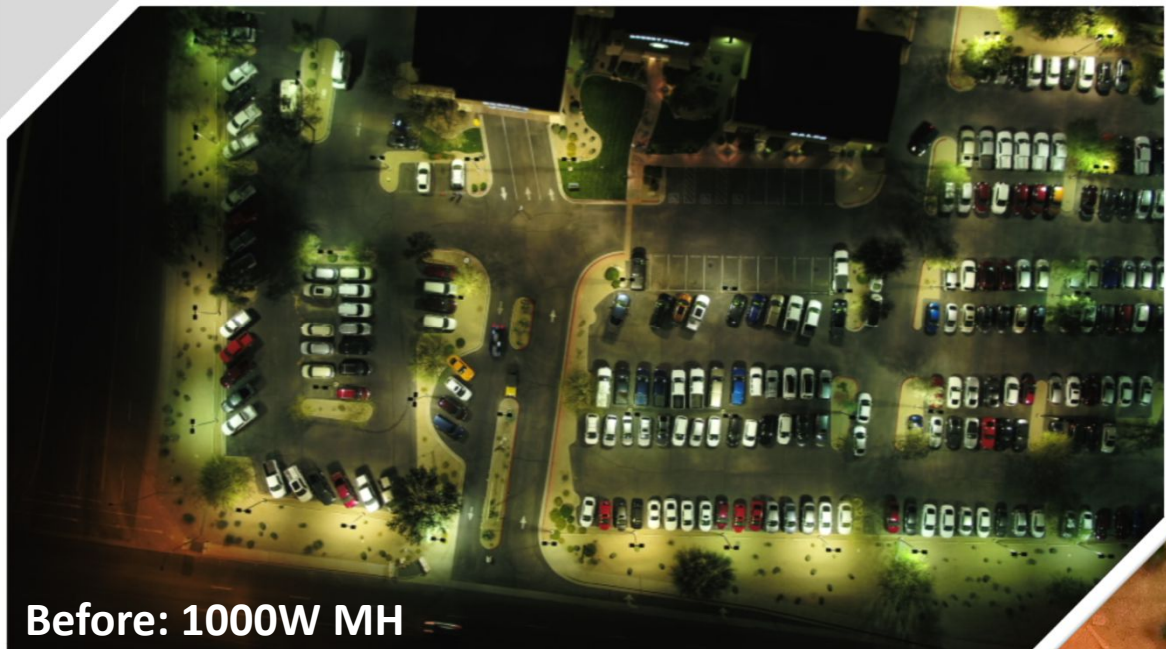
Before: 1000W MH