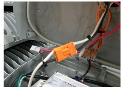
3 a) a. - Disconnect quick connection first from access panel