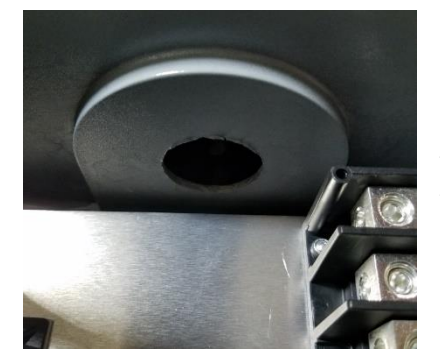
3 b) – Feed wires through hole into fixture